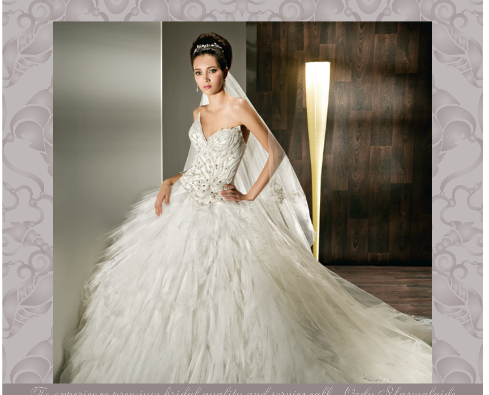
To experience premium bridal quality and service call Lady Alarmalaide for an appointment!