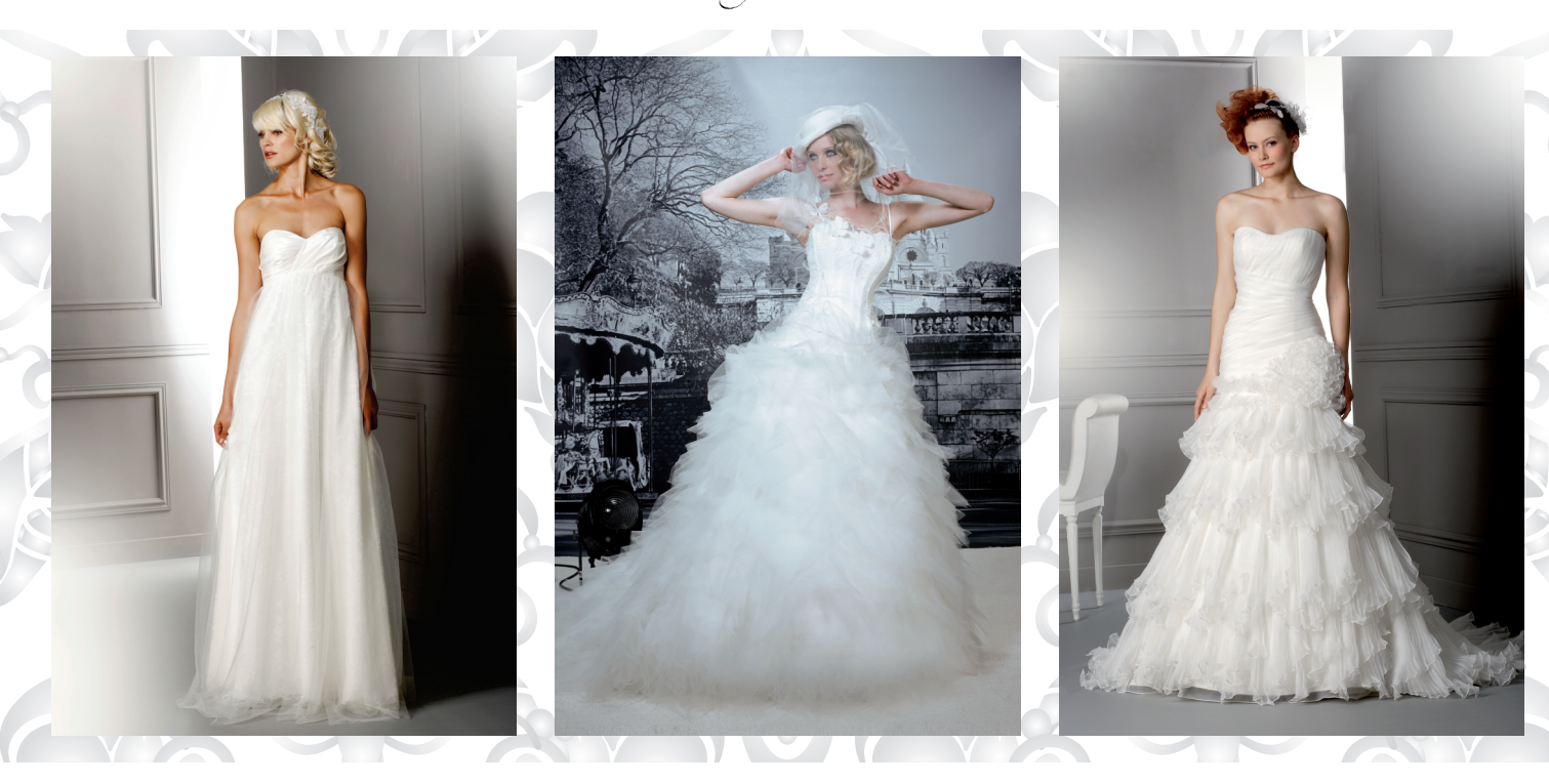
Disit us, and enjoy the experience of pure excellence!